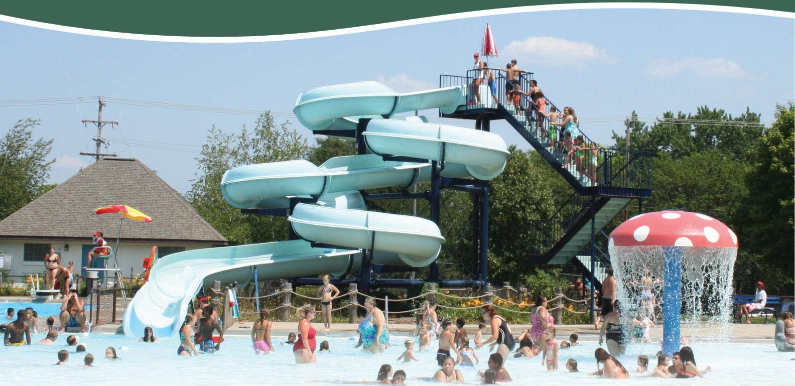
Richmond Park Pool

Visit grandrapidsmi.gov/parks to see a directory of all parks and trails.