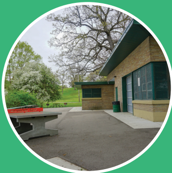
Richmond Park Pavilion