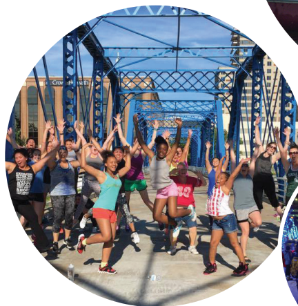
Summer Outdoor Fitness