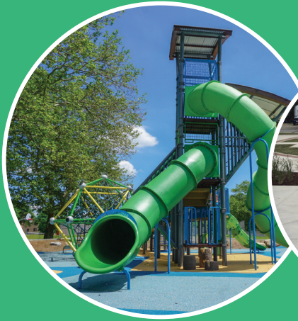
Ottawa Hills Park