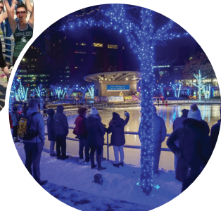
Ice Skating at Rosa Parks Circle

Visit grandrapidsmi.gov/recreation to learn more.